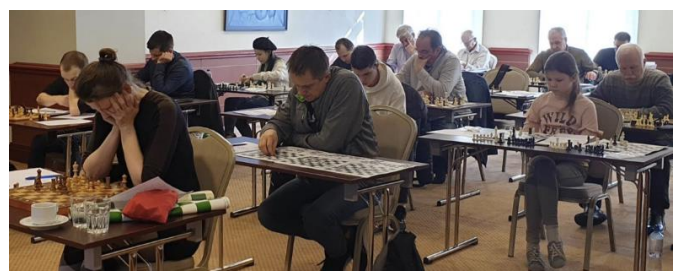
Welcome to solving Riga's selection!

In addition to the main championship, the U14 category (not rated) will be offered for the young beginners without rating or with rating up to 1700. One round, 14:30-16:30, starts together with the 2<sup>nd</sup> round of the main championship. Three winners will get medals and all participants will get certificates during the prize giving ceremony. Problem selection: Antons Gajevskis (Latvia). The details about number of problems and genres included will be coming later.